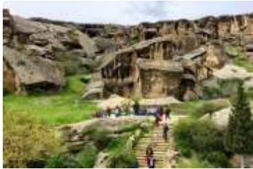
Gobustan National Park