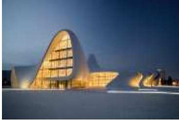
Heydar Aliyev Centre