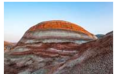
Candy Cane Mountains

For booking, contact Sumera (058-534-9712) or Natalia (055-636-8279)