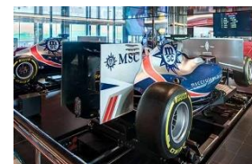
F1 VR Racer