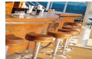
Il Patio Cafeteria