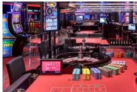
Red Gem Casino

If you are traveling with children, MSC Virtuosa makes sure that they are always entertained – starting from the Baby Club, two Teens Clubs that also serve as cinemas, a Lego club, F1 Virtual Reality Racing experience, many arcade games and the outside Polar Aqua Park.