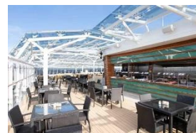
Yacht Club Grill&Bar