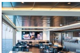
Sea Pavillion seafood