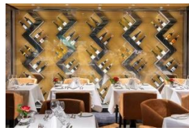
Il Campo Italian