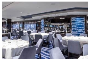
Blue Danube Rest.

In addition to the many restaurants, the ship also has a significant number of bars and lounges that offer many options for food and drink.