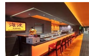
Kaito Sushi Bar