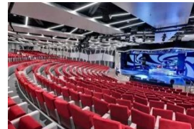
Le Grand Theater