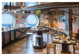
Hola Tacos Cantina