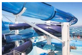
Polar Aqua Park